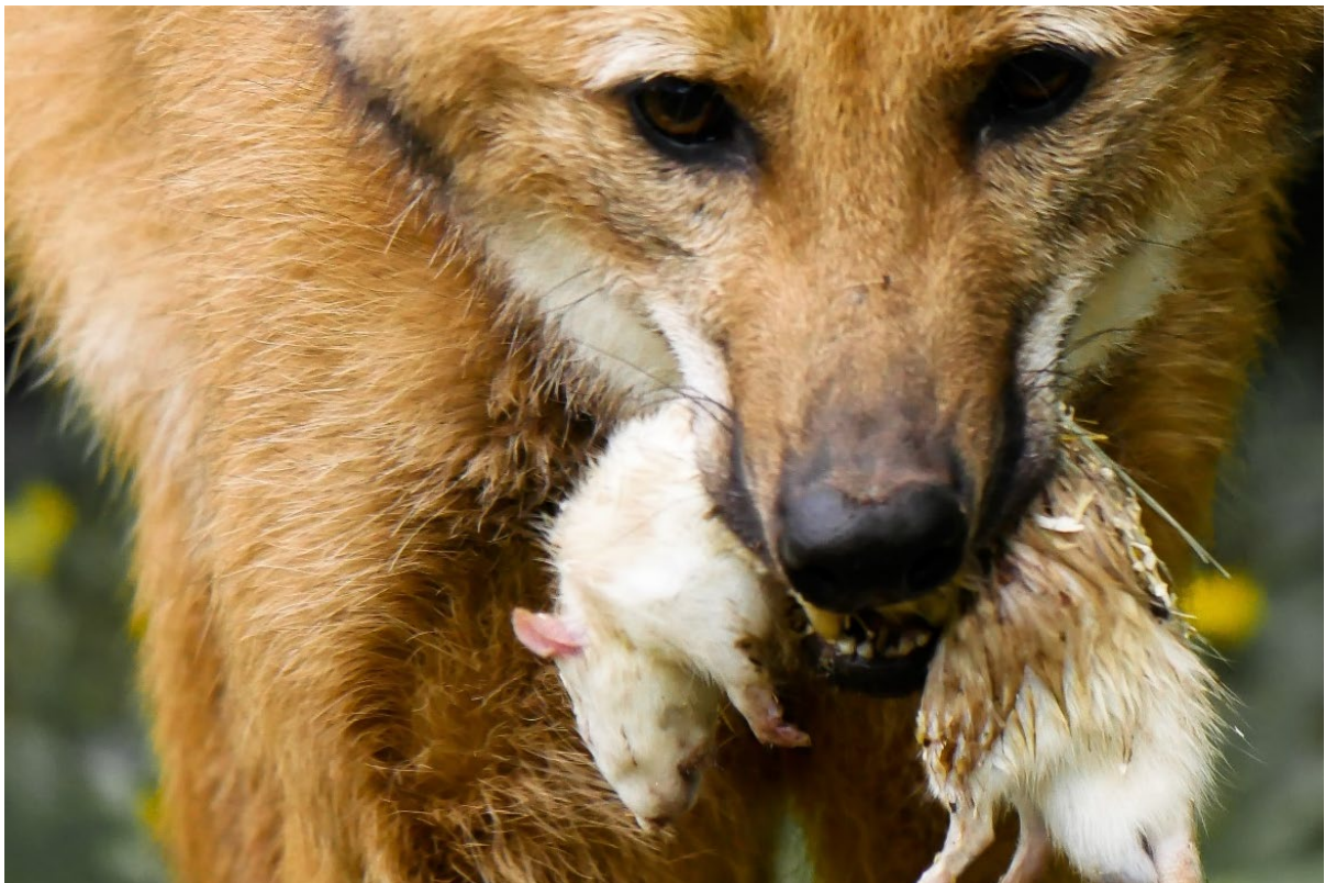
Foxes directly contribute to the decline of native species

The University recognises that the total eradication of foxes across the campuses is not viable. Instead, the University employs control methods based on best practice recommendations from local agencies and Biosecurity Officers. These methods may include poisoning/baiting, trapping, and euthanizing.