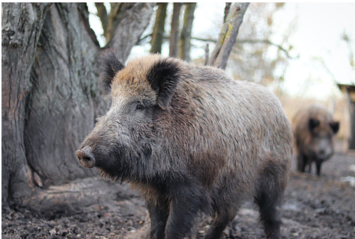
Feral pigs carry disease which impact livestock and humans

Feral pigs will often select moist areas where there is adequate food, water, and shelter. Their rutting will often foul water supplies and create areas of unusable land. In addition, they have been known to cause damage to fences through rubbing or simply pushing them over. Pigs are known to carry diseases which can impact on livestock and humans (e.g., leptospirosis and tuberculosis). Overall feral pigs cost the Australian economy $106.5 million per year.