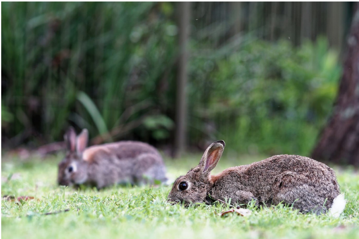
Rabbits threaten habitat of indigenous animal species

The University recognises that the total eradication of rabbits across the campuses is not practicable. Instead, the University employs control methods based on the best practice recommendations from local agencies and Biosecurity Officers. These methods may include poisoning/baiting, fumigating, warren destruction, harbour removal and the use of RHDV K5.